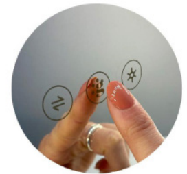
TOUCH SCREEN CONTROLS Featuring the ultimate in touch controls for ease of use