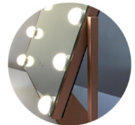
THE PERFECT ANGLE Durable aluminium base with tiltable frame for perfect positioning